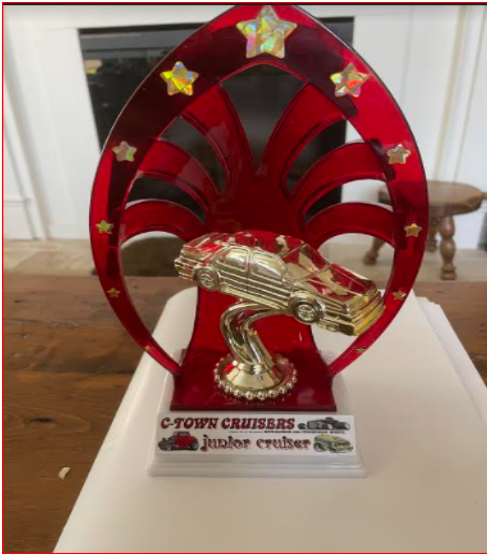
Car Show Trophies to top 40