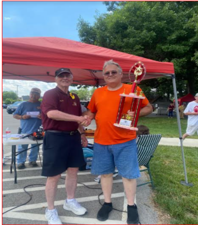
Best in show Winner